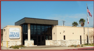
(One block from the intersection of Gollihar Road and Crosstown Expressway)