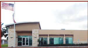
3131 Holly Road Corpus Christi, TX 78415 (Corner of Holly and Kostoryz)